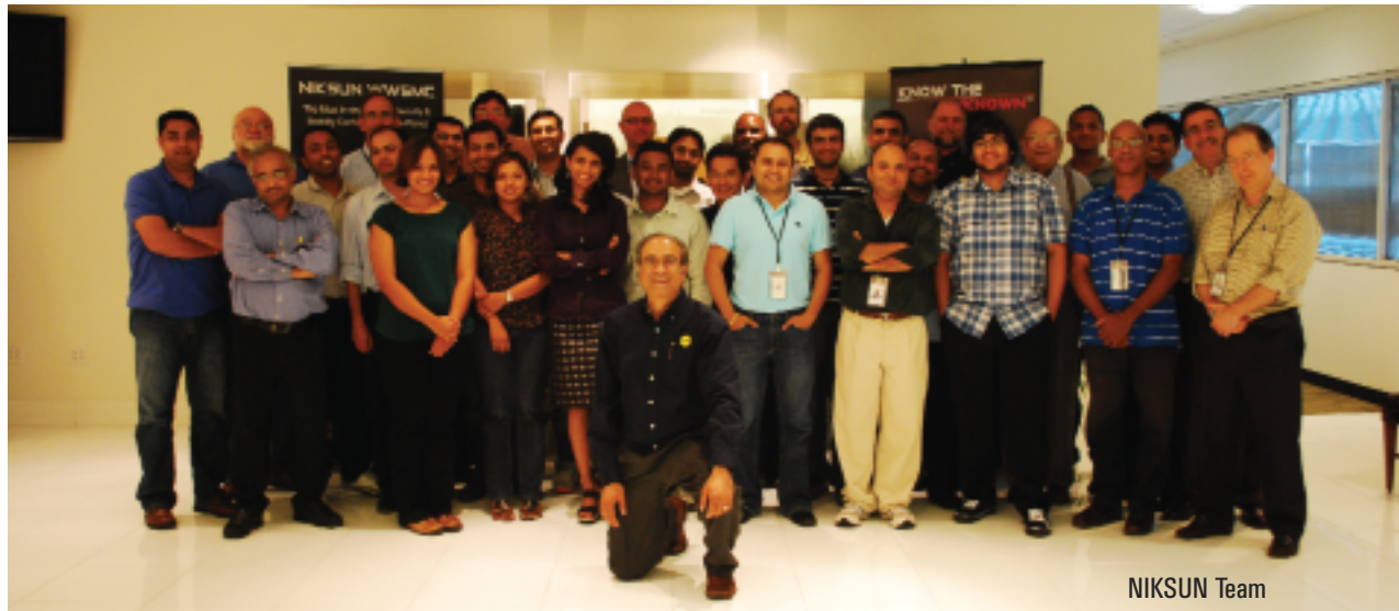
NIK SUN Team